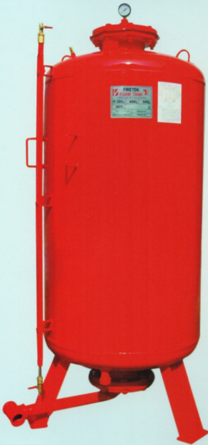
泡沫原液槽型式： FOAM TANK TYPE.